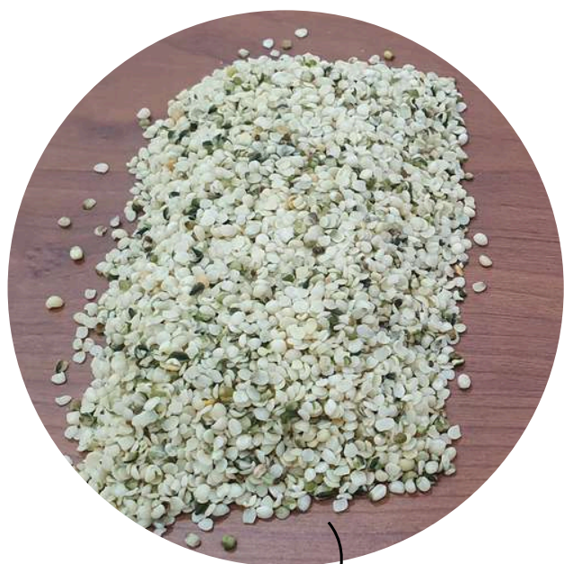
Normal Hemp Hearts