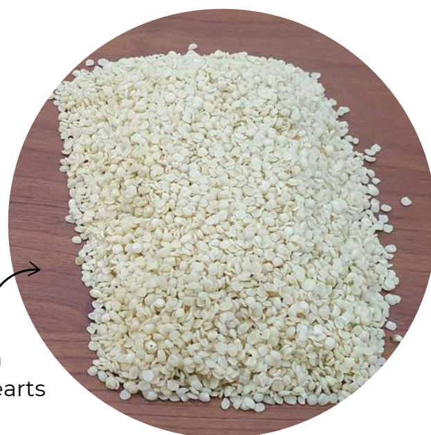
Premium Hemp Hearts